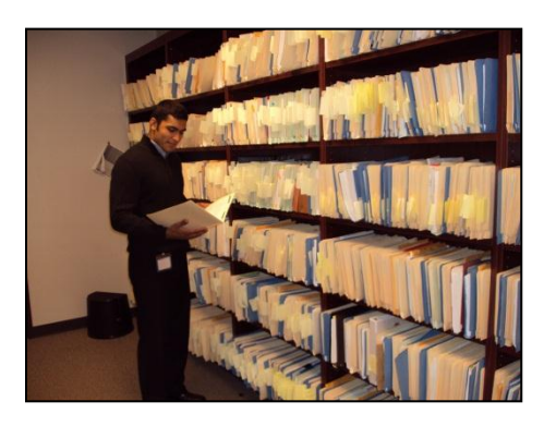
Intake Staff Reviewing a File

The OIG maintains a statewide intake process to receive communications from any individual regarding allegations of improper activity within the CDCR. Every complaint is logged and reviewed, and receives a follow-up response. Any complaints requiring a higher level of review and interaction with CDCR are referred to our regional operations teams who make direct contact with the involved institution.