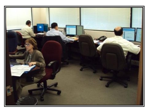
OIG's Medical Inspection Team at Work

The OIG conducts an objective, clinically appropriate, and metric-oriented medical inspection program to review delivery of medical care at each of the adult institutions in California. Every institution is inspected annually.